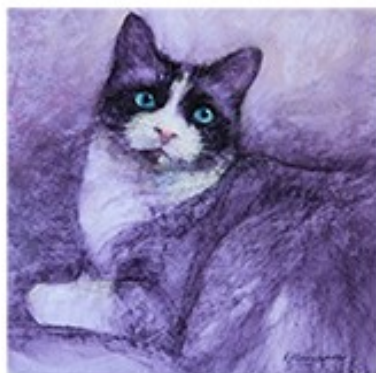
First Place, Bandit, Sherry Killingsworth