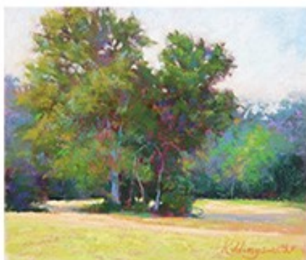
Second Place, Morning Light, Sherry Killingsworth