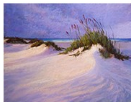
Third Place, Dunes, Sherry Killingsworth