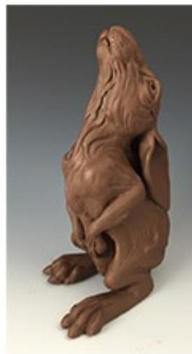
Third Place, Moon Gazing Hare, Iva Banks