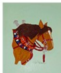
First Place, Plow Power, Poul Onderko