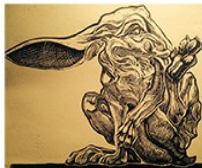
First Place, Spit Bath, Iva Banks