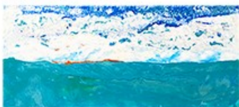
First Place, Cold, Coleen Bradfield