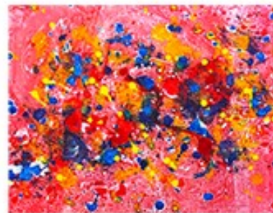
Third Place, Orange Burst, Becky Witherspoon