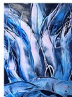
Third Place, Sea Plumes, Becky Witherspoon