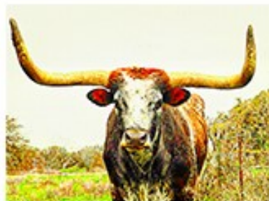
Second Place, Utopia Longhorn, Bonnie Chapa