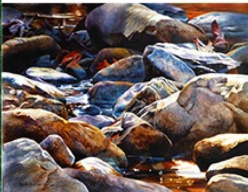
Little Red River, Monika Pate Watercolor