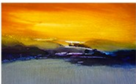
First Place, Before Night, David Sites