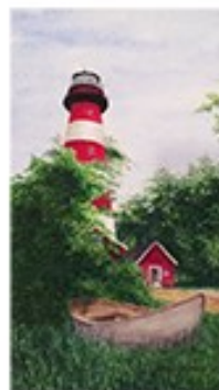
Third Place, Secluded Lighthouse, Shriyn Gabbard