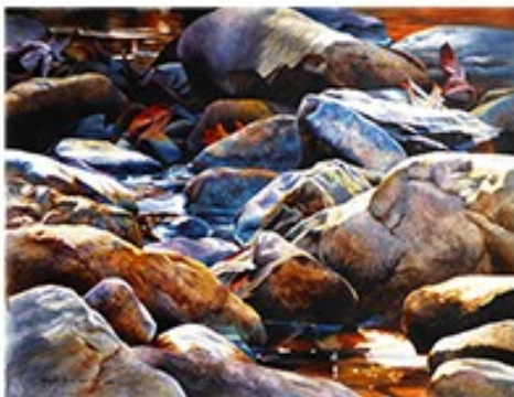
First Place, Little Red River, Monika Pate