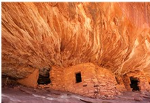
Non-Professional Division Winner House On Fire