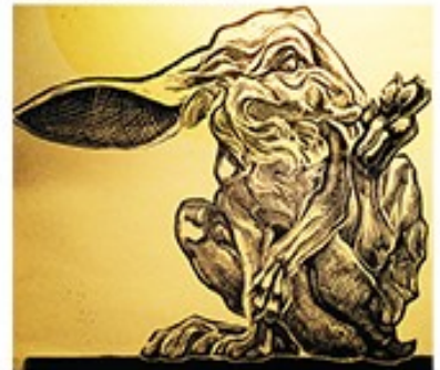
Spit Bath, Iva Banks Linocut