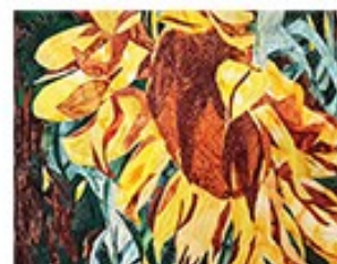
Second Place, Sunflower, Janice Dress