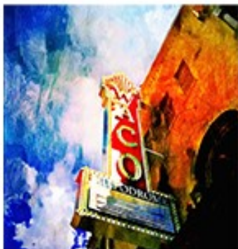
First Place, Bonnie Chapa, Waco Hippodrome