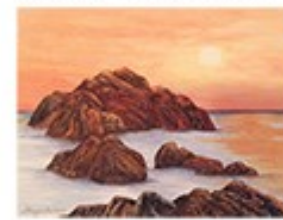
First Place, Ocean Sunset, Shriyn Gabbard