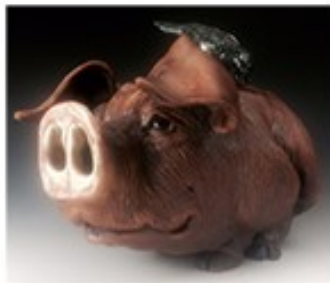
First Place, Tea Time, Iva Banks