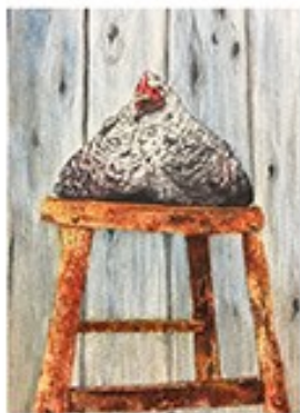
First Place, Sittin' Pretty, Dena Gaskin